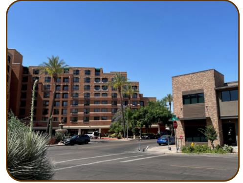
The modern office building (foreground) respectfully next to the Scottsdale Marriott (background) in the Brown & Stetson District. These buildings illustrate that contemporary and traditional building styles can coexist through building massing, compatible materials, and other design elements.

Protect the Downtown Core (Type 1) by encouraging a Sensitive Edge Buffer between higher scale Development Types (Type 2, Type 2.5, and Type 3) and the Downtown Core.