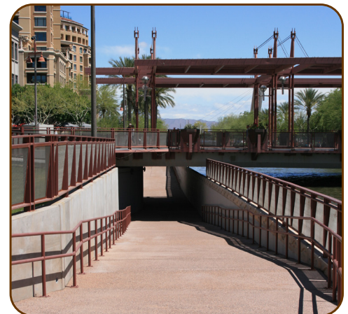
The Marshall Way Bridge underpasses provide increased connectivity along the canal in Old Town.