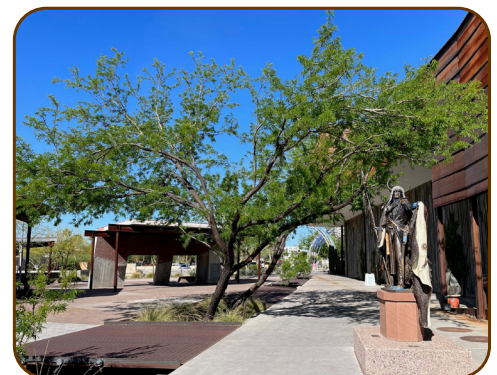
Microclimates result in more usable outdoor space.

Encourage the use of renewable energy within downtown.