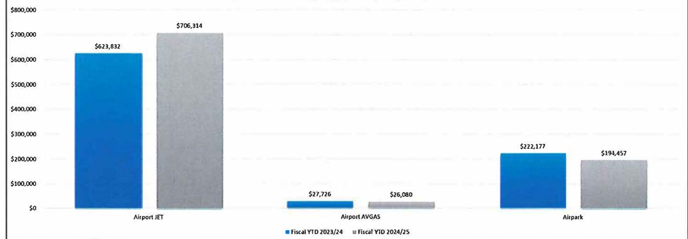
Scottsdale Airport Fuel Flowage (@ $0.10 per gallon) - Fiscal Year-to-Date