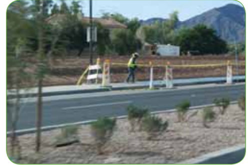
Drainage and street surfacing improvements.

Encourage both the private and public sectors to underground existing and new 69kV and lower voltage power lines throughout Southern Scottsdale, where feasible.