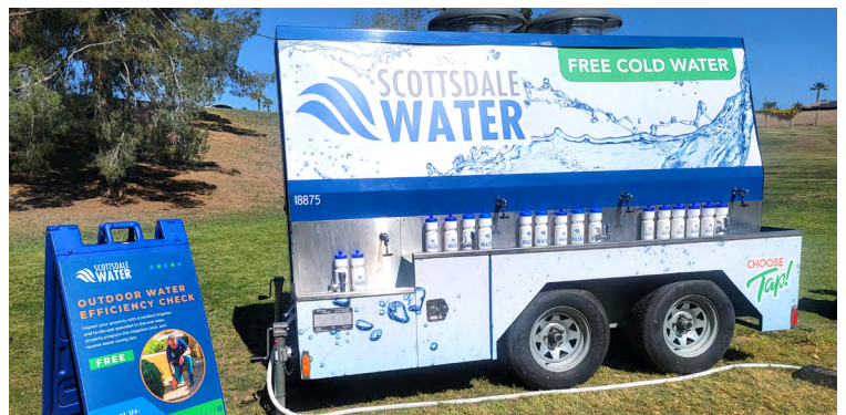
Scottsdale Water drinking water trailer

Scottsdale Water is proud to offer free water at city events to educate the community on the safety and reliability of its water. This program also informs citizens and visitors on best water conservation practices and how to be better stewards of this precious resource.