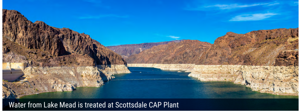
Water from Lake Mead is treated at Scottsdale CAP Plant

Depending on the time of year, the weather, and customer demand, you may receive water from a single source or from a combination of sources.