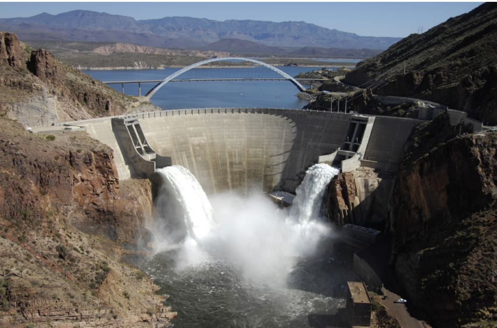
Roosevelt Dam

If you are a person with a compromised immune system (i.e. undergoing chemotherapy, have had an organ transplant or if you have HIV/AIDS or other immune system disorders) you may be particularly at risk of infections and more vulnerable to contaminants in drinking water. Some elderly persons and infants may also have increased risk. You are encouraged to seek advice about drinking water from your health care provider. More information including ways to lessen the risk of infection from microbial contaminants and potential health effects can be obtained by calling the EPA's Safe Drinking Water Hotline (800-426-4791).