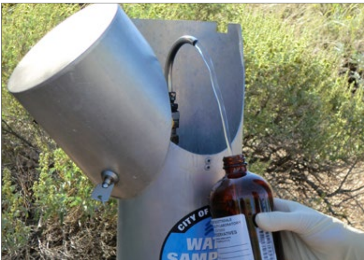
Scottsdale Water Quality Sampling Station